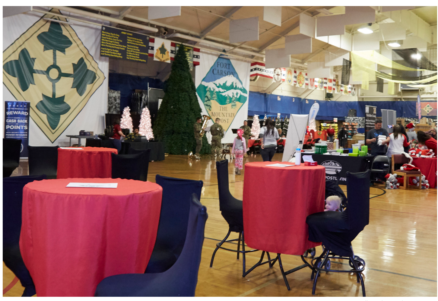
Bill Reed Special Event Center