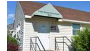
FALLEN HEROES FAMILY CENTER

Mon, Thur, Fri: 8 a.m.-4:30 p.m. Tue, Wed: 9 a.m.-4:30 p.m. Federal Holidays: Closed