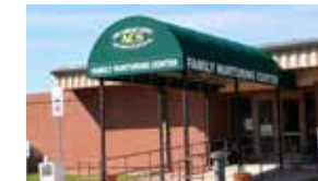
FAMILY NURTURING CENTER

Mon, Tue: 8 a.m.-5 p.m. Wed: 9 a.m.-5 p.m. Thur: 8 a.m.-1 p.m. Fri: 8 a.m.-4 p.m. Federal Holidays: Closed