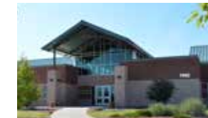
SOLDIER & FAMILY ASSISTANCE CENTER

Mon-Fri: 8 a.m.-5 p.m. Wed: 9 a.m.-5 p.m. Federal Holidays: Closed