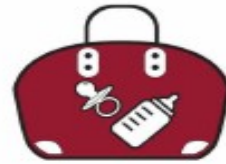
DIAPER BAGS WITH CHILD

↑ ↑ ↑ BAGS DO NOT HAVE TO BE MESH OR CLEAR