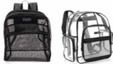
MESH OR CLEAR BACKPACK ONLY