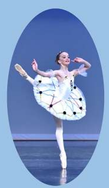
Adult Two hours a day Monday, Wednesday and Friday 5:00pm to 7:00pm

www.zamuelballet.com dance@zamuelballet.com