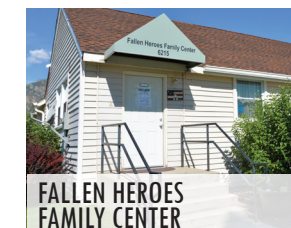
FALLEN HEROES FAMILY CENTER

Mon, Thur, Fri: 8 a.m.-4:30 p.m. Tue, Wed: 9 a.m.-4:30 p.m. Federal Holidays: Closed