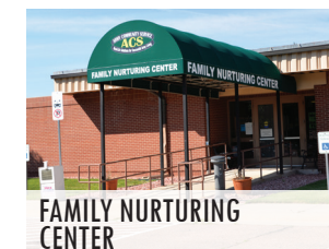
FAMILY NURTURING CENTER

Mon, Tue: 8 a.m.-5 p.m. Wed: 9 a.m.-5 p.m. Thur: 8 a.m.-1 p.m. Fri: 8 a.m.-4 p.m. Federal Holidays: Closed