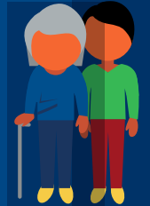
dependent adult of any age